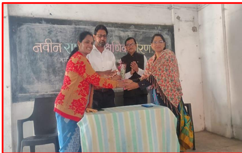
Felicitatation of Resource person

All the basic information about NEP-2020 and its features, benefits for students and flexibilities offered in higher education, change in curriculum were explained to students during the program.