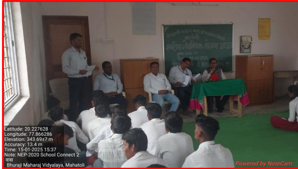
Faculties and students during the program