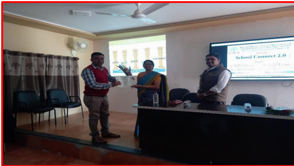
Felicitation of Resource person