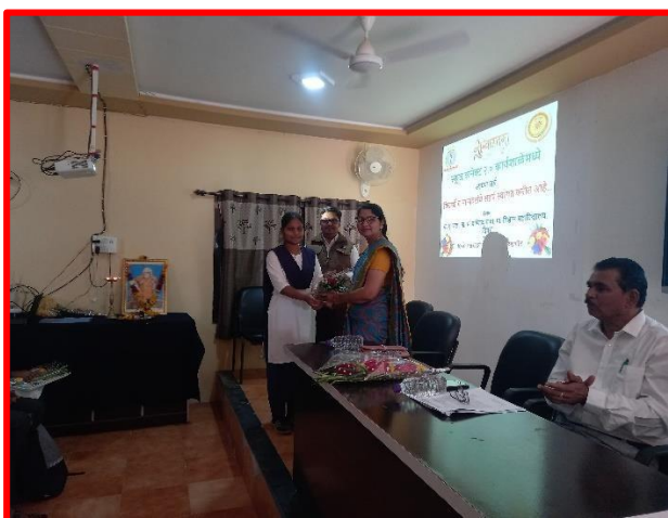
Felicitation of Resource person