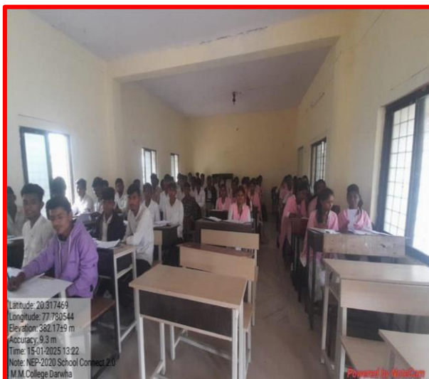
Faculties and students during the program