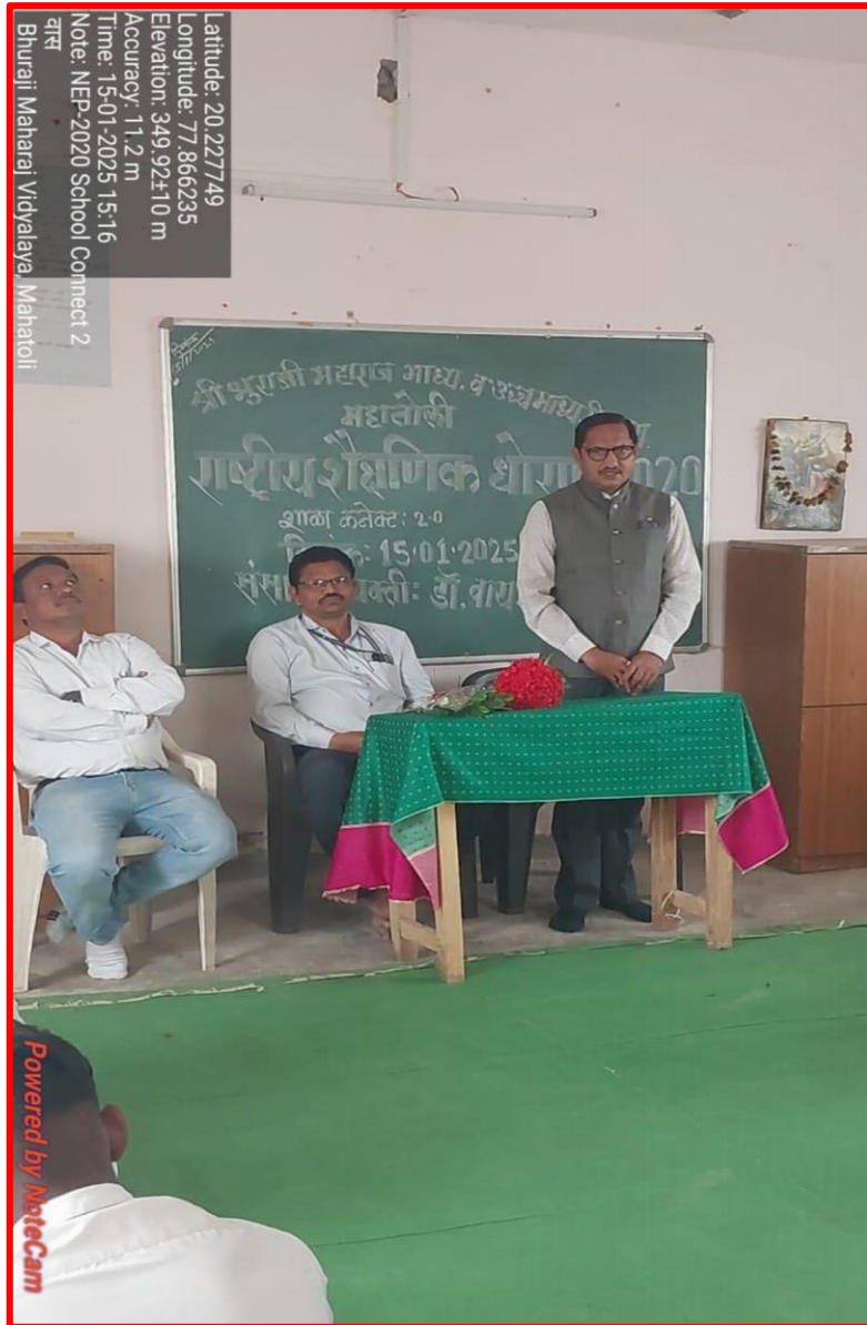
Guidance by Resource person