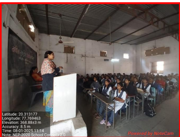
Guidance by Resource person