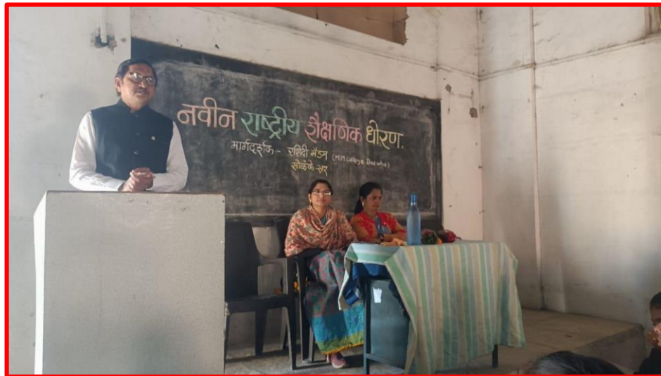
Guidance by Resource person