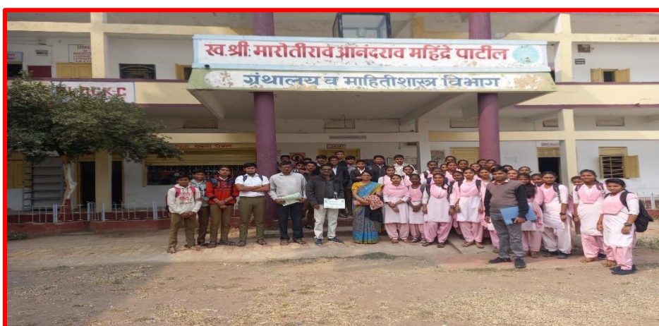
Campus Tour Faculty members and students during the visit to Library and departments