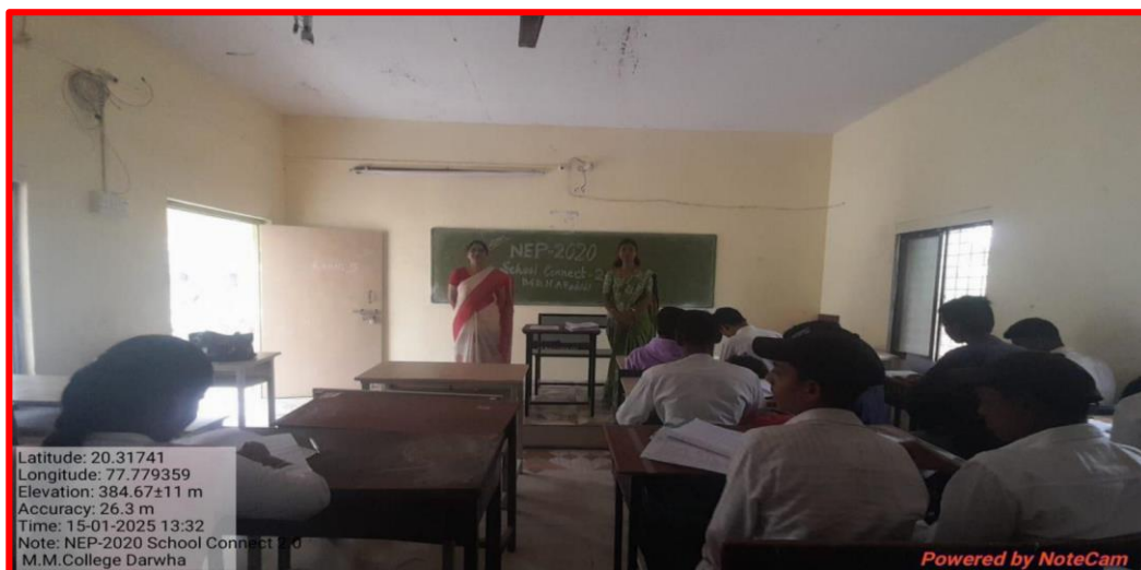
Guidance by Resource person